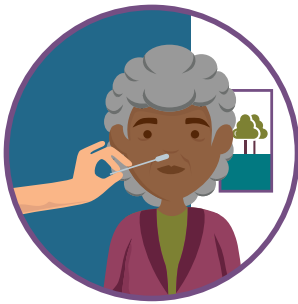
Testing patients for COVID.

The risk of getting COVID in the hospital is actually low. That's because hospitals are taking precautions like these: