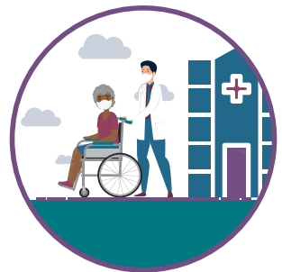
Discharging stable LVAD patients more rapidly after their surgery.