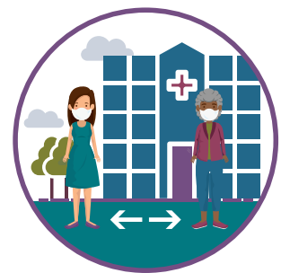
Mask wearing, social distancing, and handwashing.