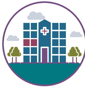
Placing COVID patients in separate units.