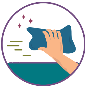
Enhanced cleaning procedures.